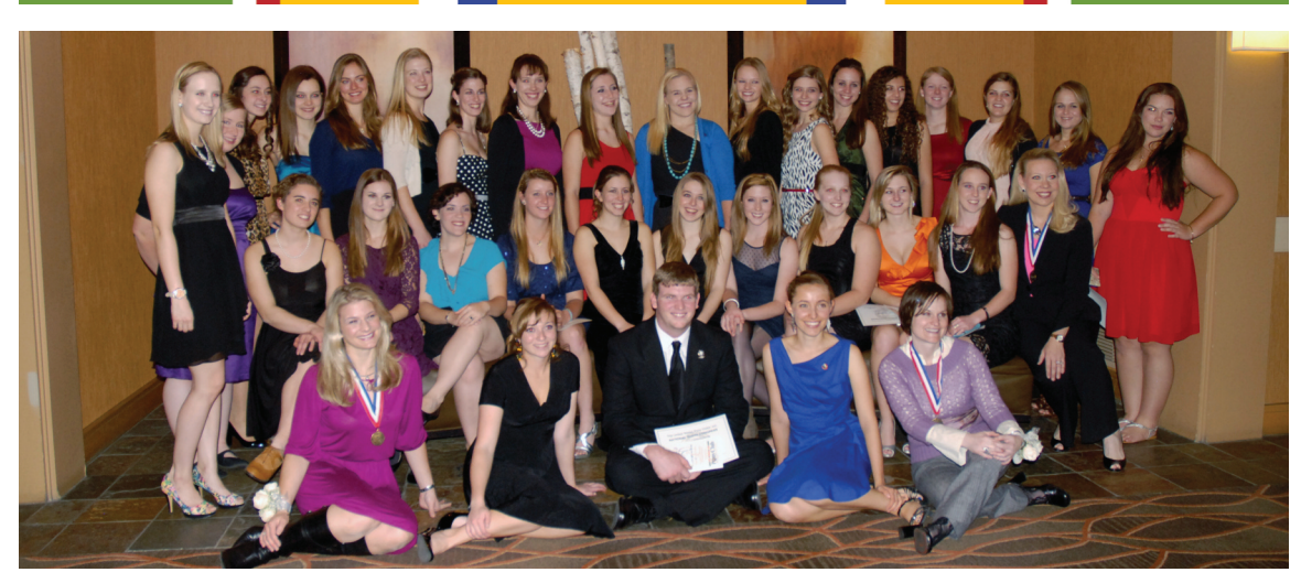
National Youth Board and Academy of Achievement